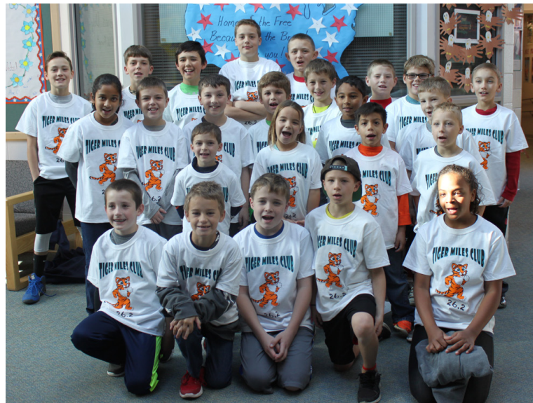
Schools receiving GO! Grants are required to become Let's Move! Active Schools to sustain their new activations. KIDS in the GAME is one of 35 LMAS national partners collectively promoting our resources to help get kids moving for at least 60 minutes per day.